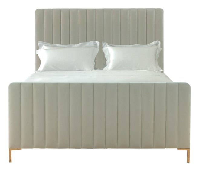
Upholstered in Whistler 'Evora Oyster EVR229' Metal legs with a brass finish N°1

Featuring a contemporary hand-stitched panel headboard and footboard, the Chrissy boasts a beautifully sleek aesthetic. From a super soft leather to textured linen, the versatile vertical pattern looks exquisite upholstered in an array of fabric options.