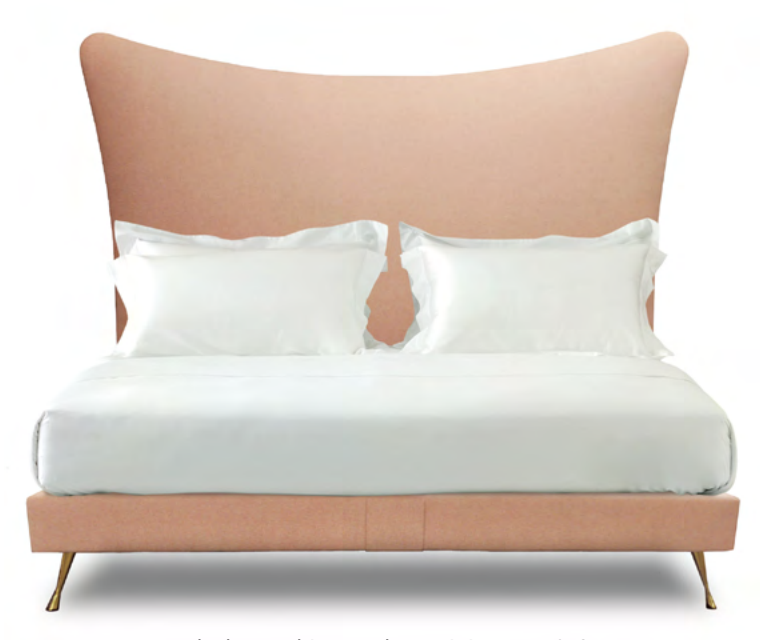
Upholstered in Kvadrat 'Divina MD 613' Harlech legs in antique brass finish N°4

Soft rose and bold lines. A film noir arch leads to a slender base, for balanced opulence.