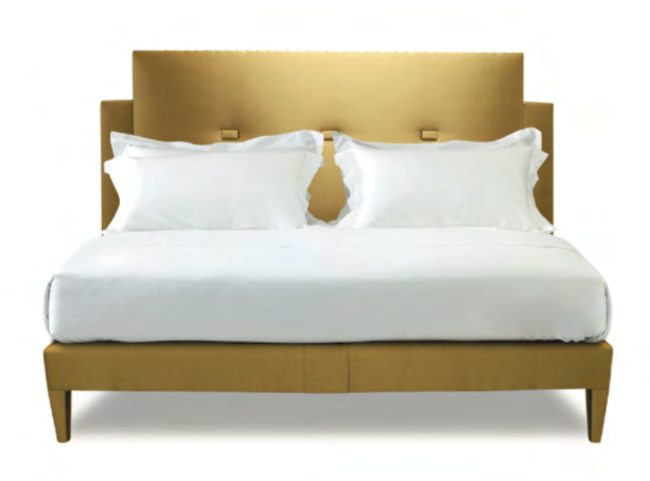
Upholstered in Kobe 'Chacar 3914/43' with covered buttons Upholstered Georgian legs N°4

Drawn from the Jazz age and the Savoy's heyday. An essence of Art Deco: a geometric layered headboard in perfect proportions. Precisely angled and tapered legs act as a counterpoint.