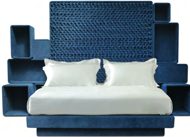
Upholstered in 'Powder' blue Alcantara® with side modules in matching fabric N°4

A collaboration incorporating a 1970's retro silhouette featuring pod-like cubby-holes and a headboard made entirely of pocket springs.